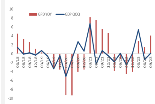
Figure 1: Meagre q/q growth